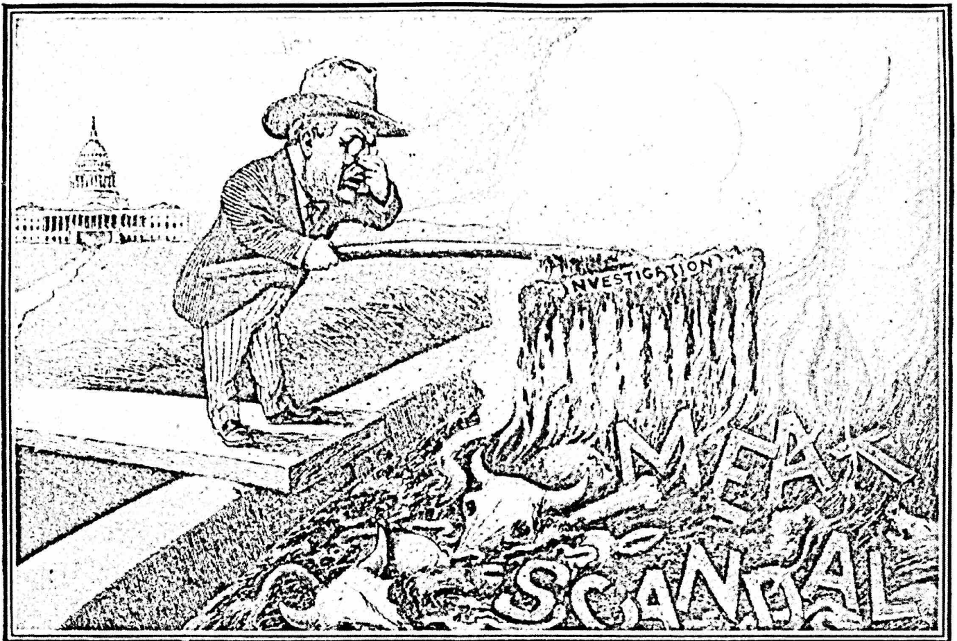
A Nauseating Job, But It Must Be Done