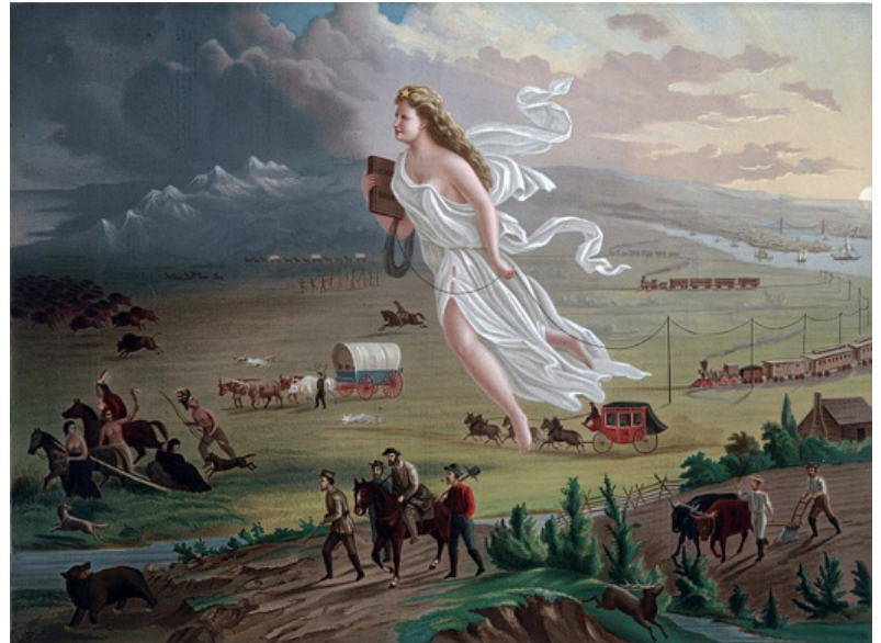
John Gast, American Progress

The period after the Civil War during which Northern political leaders imposed strict regulations and governance on the South so that the South could rejoin the Union