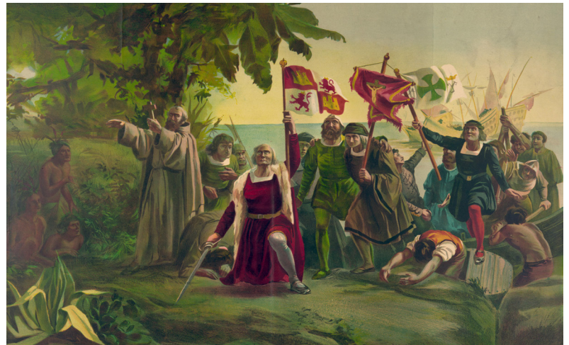
The legacy of Christopher Columbus is still being debated. Some see him as a noble explorer, while others blame him for the wrongs inflicted on the American Indian population. How do images like this shape his image?

A forced labor system developed by the Spanish that required American Indians.