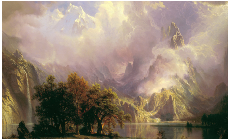
Albert Bierstadt, Rocky Mountain Landscape

© Marco Learning, LLC. All Rights Reserved. AP® is a trademark registered by the College Board, which is not affiliated or connected with Marco Learning LLC nor does the College Board approve, sponsor or endorse our products or website.